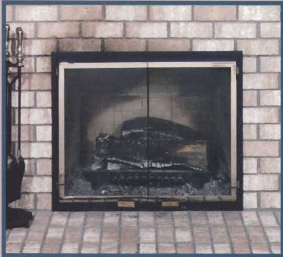
Nickel Plated Version

The Full View, sealed fireplace door, will compliment any fireplace with its elegant style and eliminate excess air loss from the home.