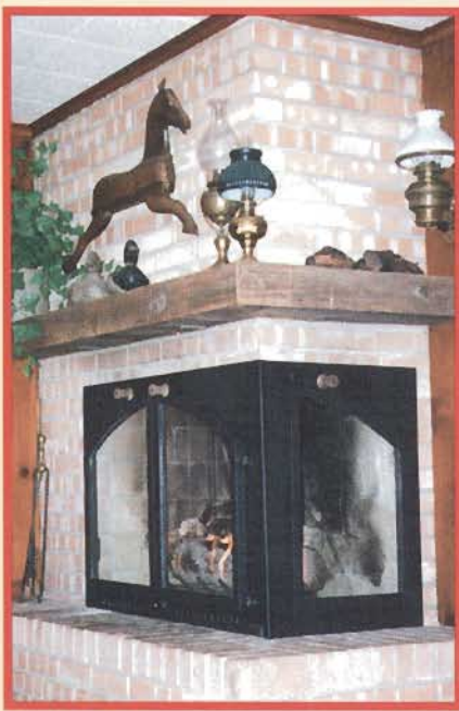
Custom Corner Door