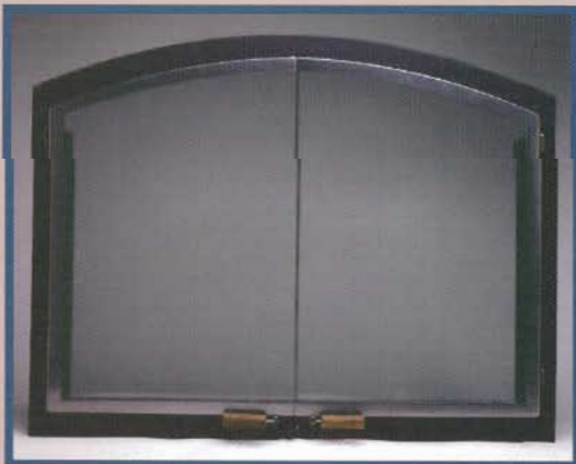
Brushed Steel Arched Glass

Sliding or swinging screens, tinted or ceramic glass, arched glass sections and frames for arched openings, recessed mounting, electroplated finishes in 24 carat gold or nickel, Swedish steel, hammered steel, or brushed steel finishes.