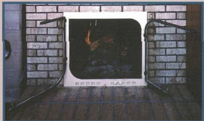
Custom Full View Door